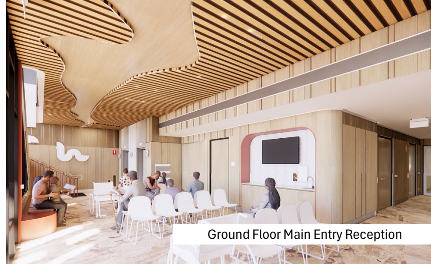
Ground Floor Main Entry Reception