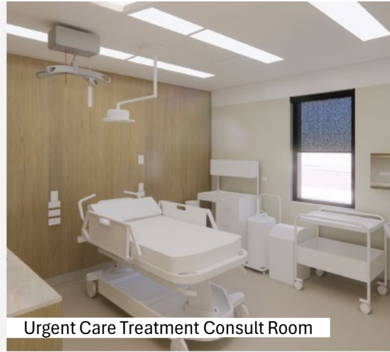
Urgent Care Treatment Consult Room