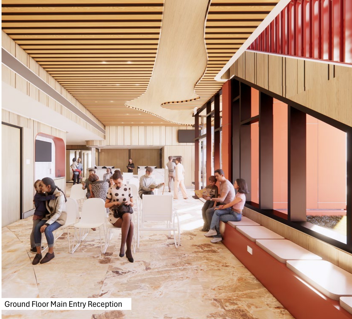
Ground Floor Main Entry Reception