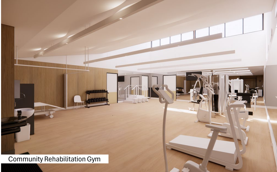
Community Rehabilitation Gym