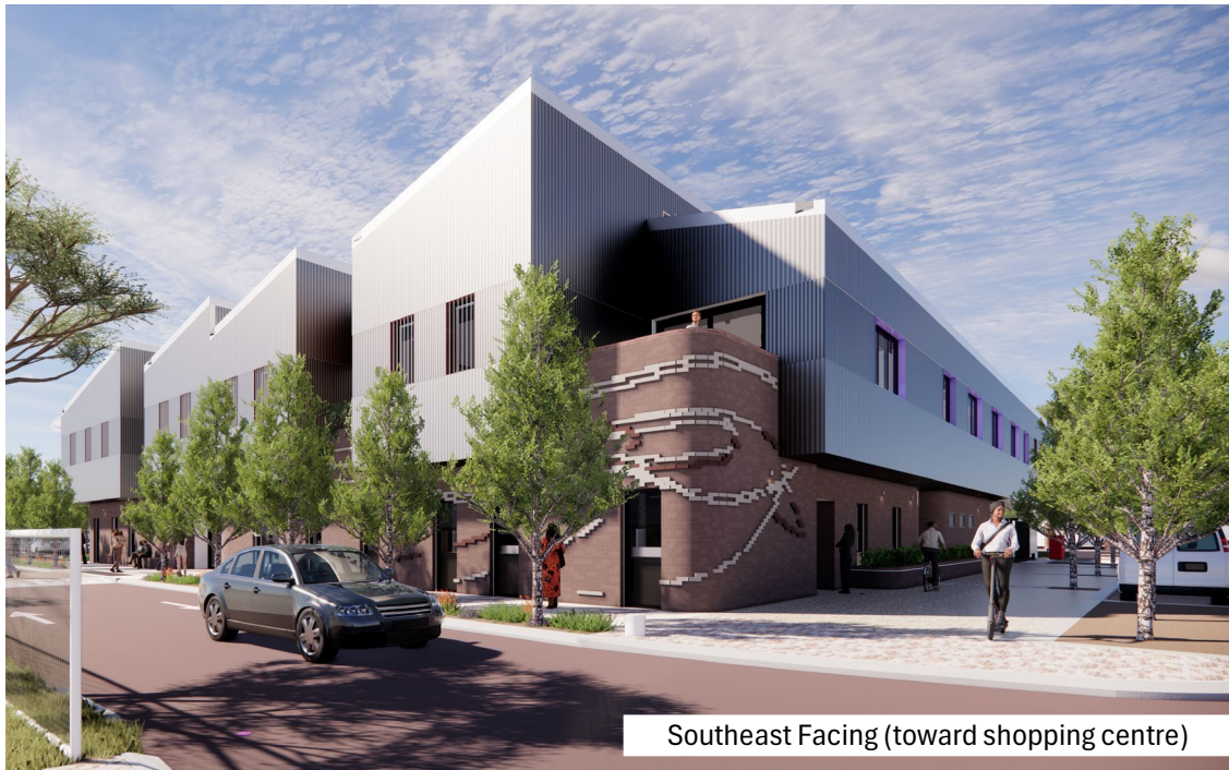
Southeast Facing (toward shopping centre)