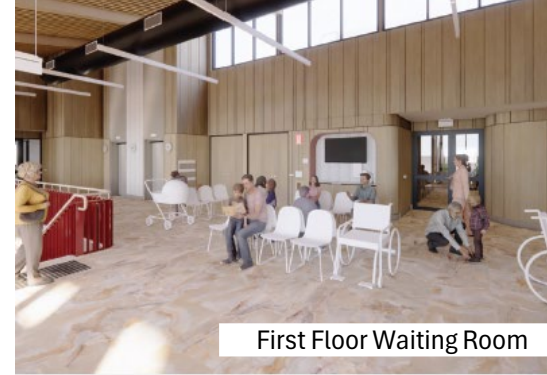
First Floor Waiting Room