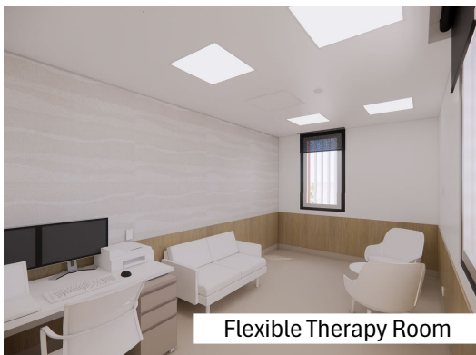
Flexible Therapy Room