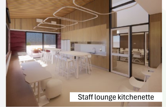
Staff lounge kitchenette