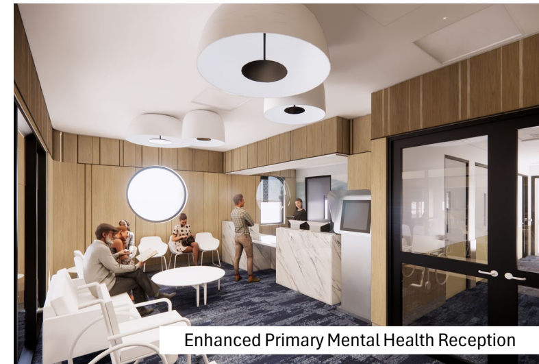
Enhanced Primary Mental Health Reception