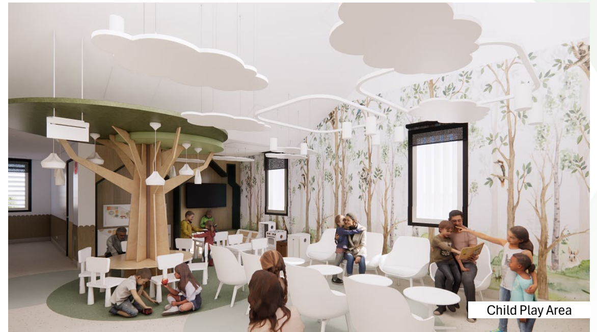
Child Play Area