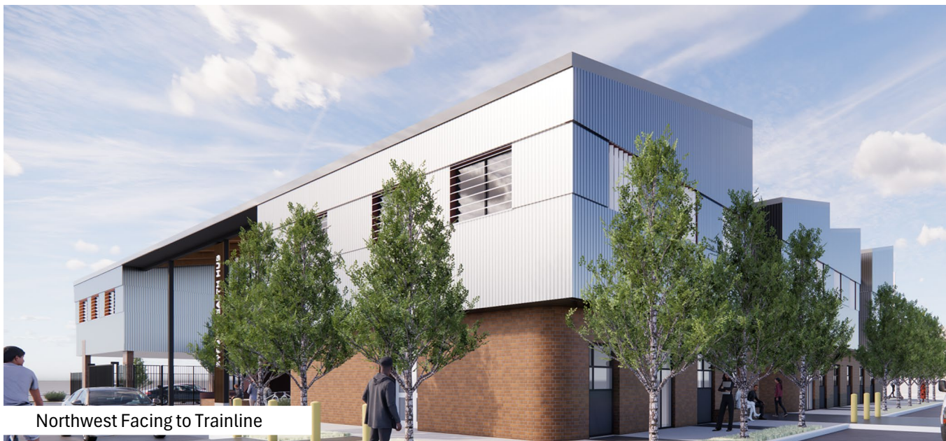
Northwest Facing to Trainline