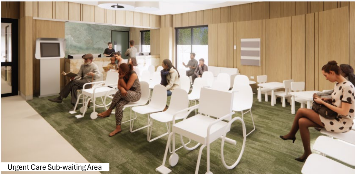
Urgent Care Sub-waiting Area